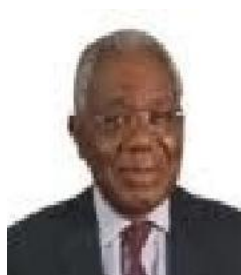
Chief Ernest Shonekan Head of Interim National Govt. (Aug.26th 1993 – Nov. 17th 1993)