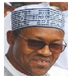
Maj. Gen. M. Buhari Head of State (Dec.31 st 1983 – Aug. 27th 1985)