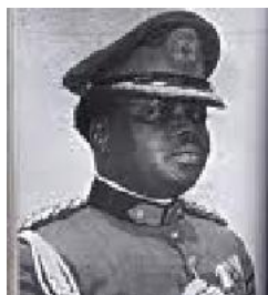
Gen. Muritala Mohammed Head of State (July 29th 1975 – Feb 13th 1976)