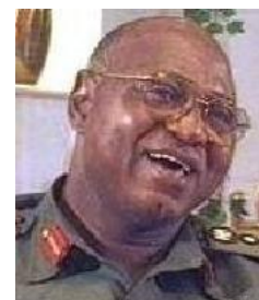
Gen. Abdusalam Abubakar Head of State (June.9th 1998 – May 29th 1999 )