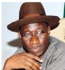
Dr. Goodluck E. Jonathan President ( May 6th 2010 - Date )