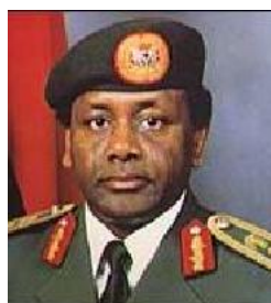
Gen. Sani Abacha Head of State ( Nov. 17th 1993– June.8th 1998)