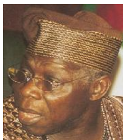
Chief Olusegun Obasanjo President (May 29th 1999 – May29th 2007 )