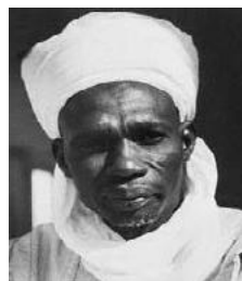
Sir. Abubarka Tafawa Balewa First Prime Minister (Oct.1st 1960 – Jan15th 1966 )