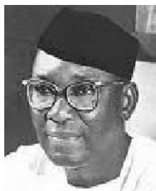
Dr. Nnamdi Azikiwe First Gov. Gen.(1960–1963) President 1963 – 1966