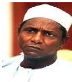
Alh. Umar Musa Yar'Adua President ( May 29th 2007 – May 6th 2010 )