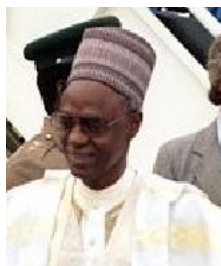
Alh. Shehu Shagari First Executive President (Oct1st 1979 – Dec.31 st 1983)