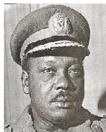
Gen. Aguiyi Ironsi First Military Head of State (Jan.15th-July29th 1966)