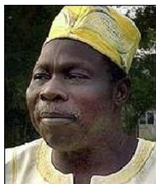
Gen. Olusegun Obasanjo Head of State (Feb 14th 1976 – Oct.1st 1979)