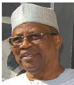
Gen. Ibrahim B. Babangida First Nigerian Military President (Aug.27th 1985 - Aug.26th 1993)