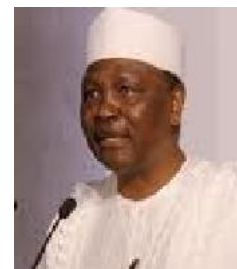
Gen. Yakubu Gowon Head of State (July 29th 1966 – July 29th 1975)