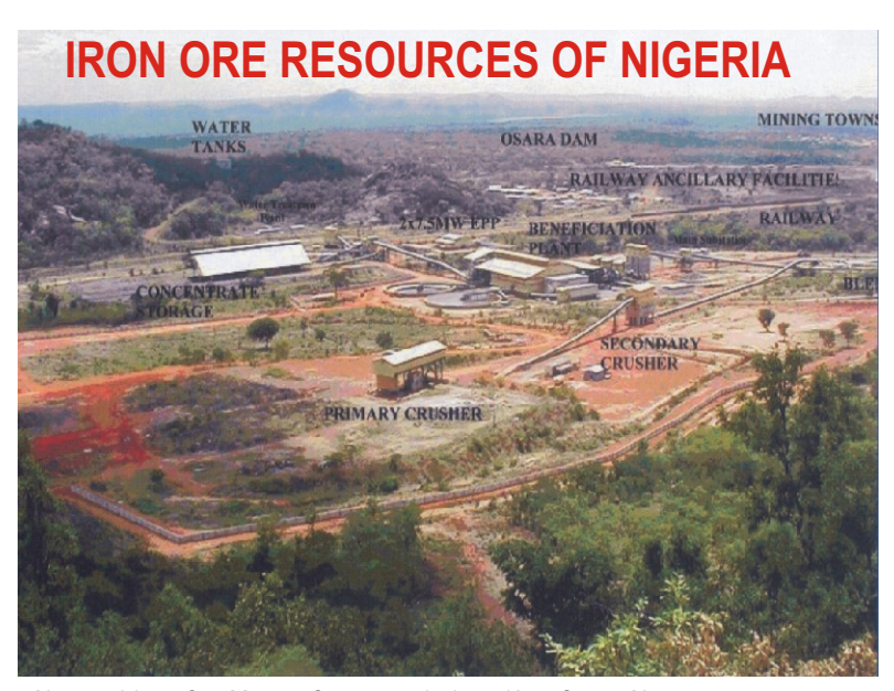
National Iron Ore Mining Company, Itakpe, Kogi State, Nigeria