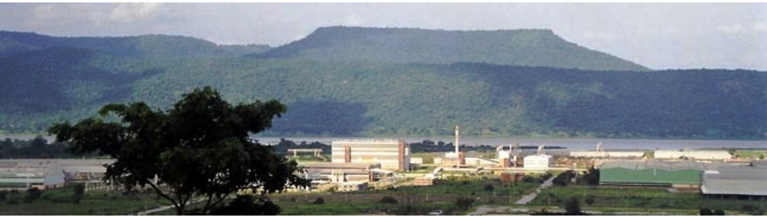
Ajaokuta Steel Complex: Utilizing iron ore from Itakpe mines